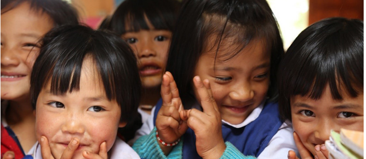
Nursery School Children in Ban Mhai Pattana

The project is currently the main activity of the Pistorio Foundation and fully reflects the village approach, according to which village by village the organization ensures that children are given access to education through its scholarship program and by improving or building infrastructures in the most remote villages, and subsequently addresses issues of community development including access to water and health and family income.