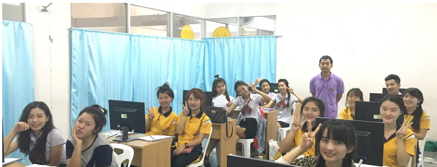
New Informatics class set up with the support of the STMicroelectronics Foundation

In 2016 we launched a partnership with STMicroelectronics Foundation in order to allow our professional school beneficiaries the possibility of attending computer classes. The Digital Unify program, that we propose through this collaboration, has the aim of delivering basic Information Technology skills and notions through a 20-hour course where the students can become acquainted with and learn how to independently use IT tools for educational purposes. The students are also allowed access to the computer facility outside course hours and after the completion of the course, in order to use these tools, consolidate their newly acquired skills, and access the web.