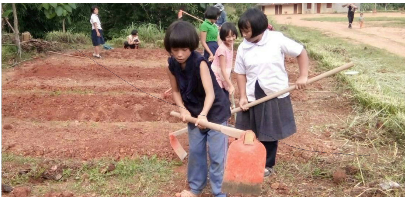
Students in Huay Kuk Village working in the village school garden plantations

These initiatives have been completed, in selected locations, with the multidisciplinary school garden project. The key idea is to teach hill-tribe children from a young age how to cultivate and produce food that can be then consumed for the school canteen meals. The project fulfills multiple purposes including integrating the school curricula; improving self-sustainability of village schools through the active participation of its main stakeholders - children and school staff; introduce children to agriculture and skills that they may develop in the future and use as potential sources of income; improve overall health and nutrition of the community through the cultivation and consumption of fresh and organically grown food; increase awareness within the community of the importance of environmental protection issues and respect of the soil and land through organic agricultural methods.