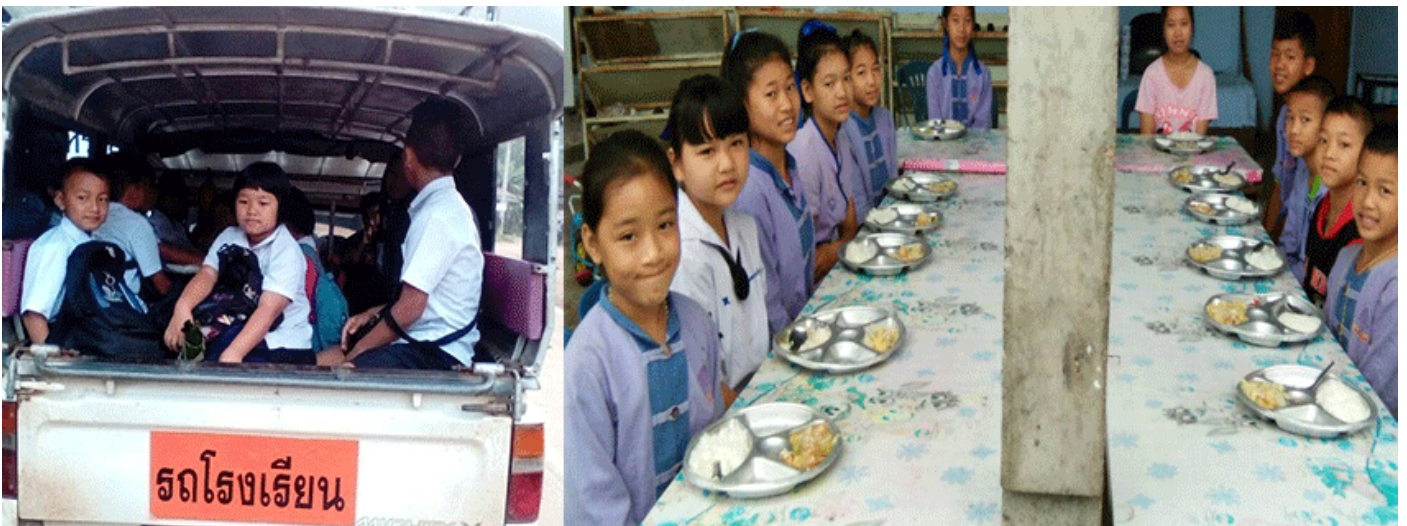
The scholarship program provides Transportation to school, school supplies and uniforms, and meals in school to hill-tribe children

The project has grown steadily and significantly over the years and we have been able to send over 3,000 hill-tribe minority children to school since 2006, providing them what they needed to access and succeed in school including school fees, uniforms, school supplies, transportation, meals in school, medical check-ups, teacher supplementation, and tracking of their scholastic progress and general development. Moreover, new and improved village school infrastructures which we equipped with sanitation facilities as well as proper kitchens and canteens, and educating children on hygiene and access to medical assistance, helped significantly improve the living conditions of the entire community, as incidence of common illnesses dropped and general hygiene and health levels improved.