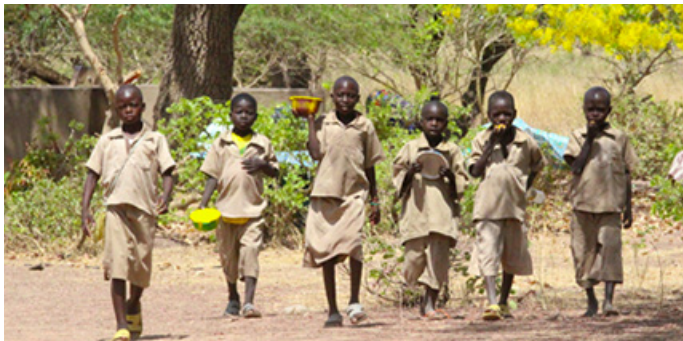
Students of Nibagdo primary school heading to school

Since 2006, the Foundation has supported the education of 119 underprivileged students from the region of Boulkiemde, providing also basic health care and nutrition, micronutrients, vitamin supplements, anti-parasite medication, soap, and hygiene training. The Foundation expanded a primary school in 2007, adding sanitation facilities, canteen, kitchen, and extra classrooms, doubling its capacity, and subsequently built a Secondary School in the nearby village of Sogpelce' which now holds over 700 students.