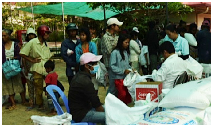
Rice distribution to families of beneficiaries