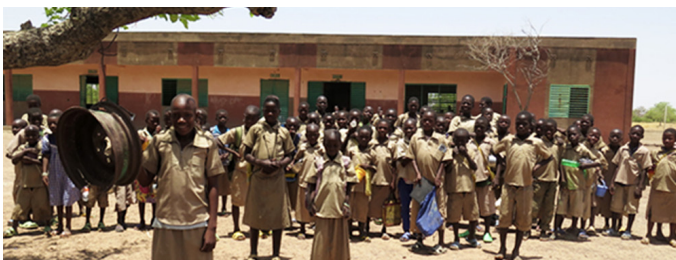
Nibagdo primary school. The girl in the foreground is sounding the school bell.

Since 2006, the Foundation has supported the education of 119 underprivileged students from the region of Boulkiemde, providing also basic health care and nutrition, micronutrients, vitamin supplements, anti-parasite medication, soap, and hygiene training. The Foundation expanded a primary school in 2007, adding sanitation facilities, canteen, kitchen, and extra classrooms, doubling its capacity, and subsequently built a Secondary School in the nearby village of Sogpelce' which now holds over 700 students.