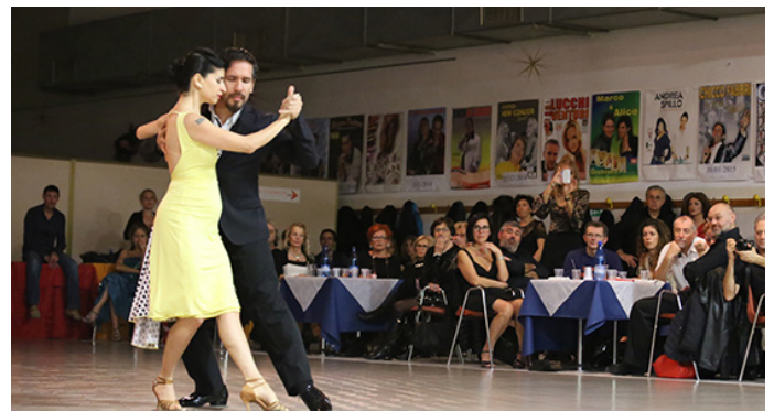
"Serata Tango" fundraiser in Modena