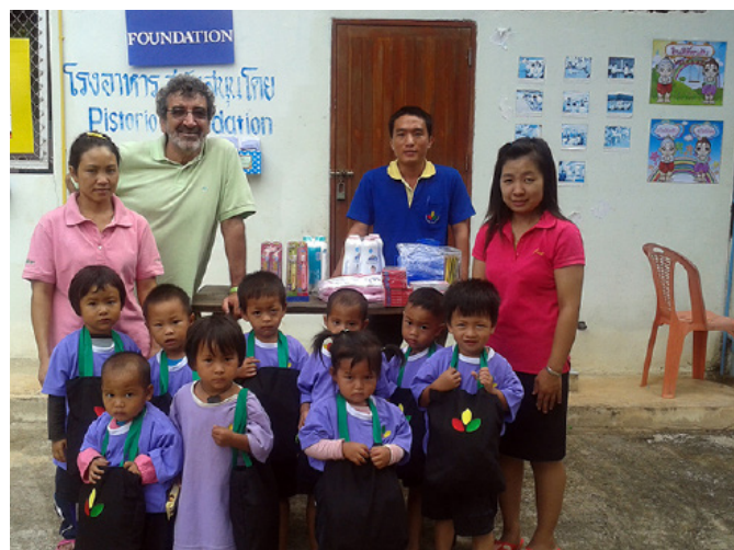
Distributions of supplies and uniforms to preschool children