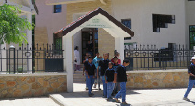
The Non Formal Education and Vocational Training Center co funded by the Foundation in 2013