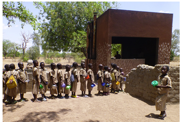
Primary school children lining up for lunch at the school kitchen.

Families have increased their income and are motivated to continue to earn enough funds to support their own children in school.