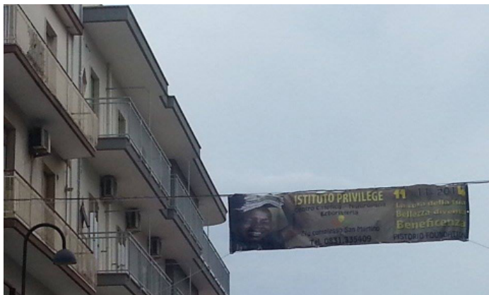
Istituto Privilege Ostuni benefit in favor of the Foundation