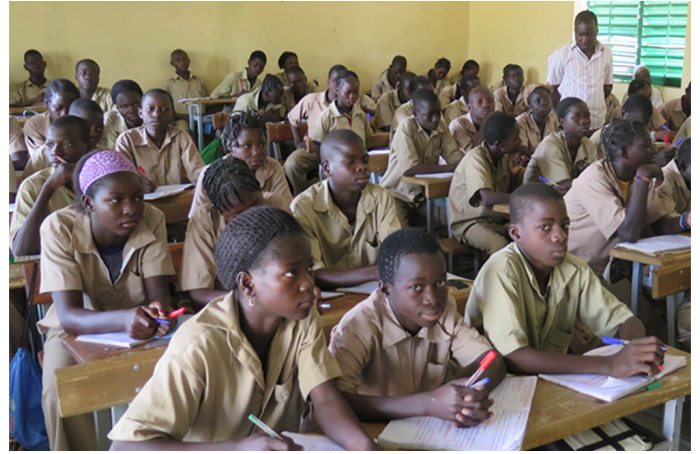
Secondary school classroom