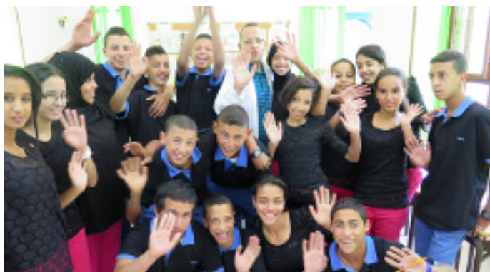
Students of our Non Formal Education Program

Here is a video of the program in 2014, created by our beneficiaries. https://mail.google.com/mail/u/1/#inbox/14dbf5258975f211?projector=1