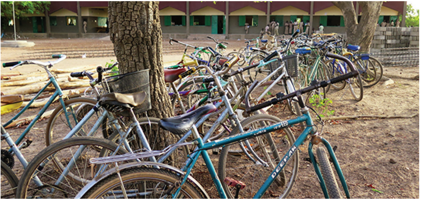
Many students are provided with bicycles to reach the secondary school

Our secondary school is considered the best in western Burkina for the quality of its teaching staff, low pupil/teacher ratio (53 compared to 60 nationwide) and students' results.