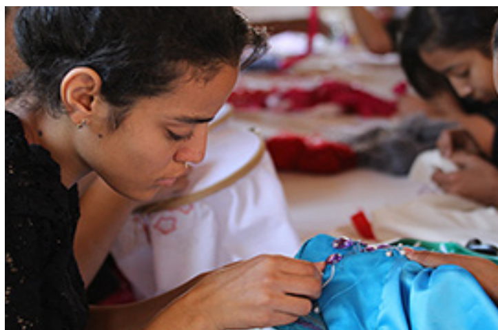
Embroidery class as part of Vocational Training Program