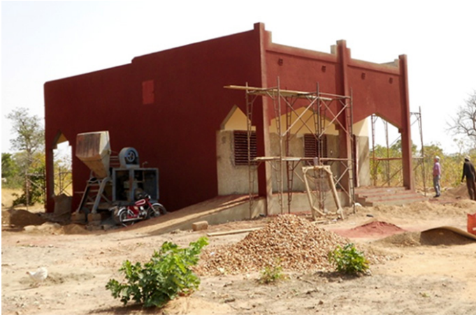
New classroom built at the secondary school in Sogpelce