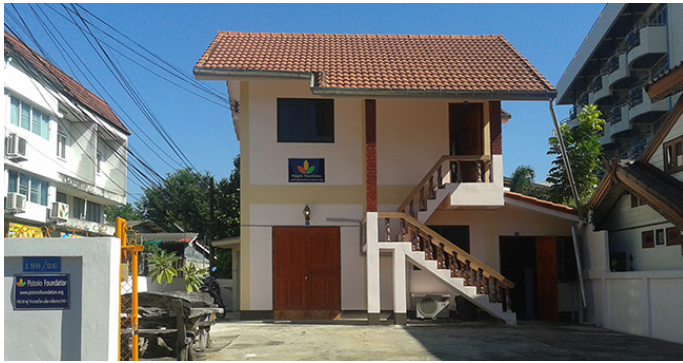
Pistorio Foundation Offices in Chiang Rai