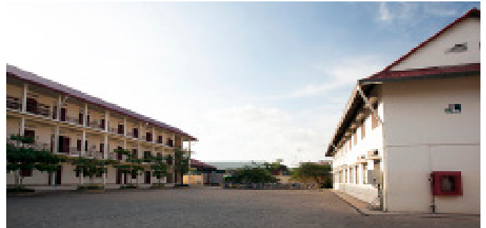
PSE School Campus

Direct Beneficiaries since start of Project: 133