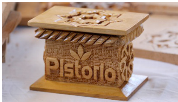
Handcrafted wooden box created by our beneficiaries

Number of students who have completed professional school since 2010: 17 (of which 11 are working and 4 have gone on to higher studies)