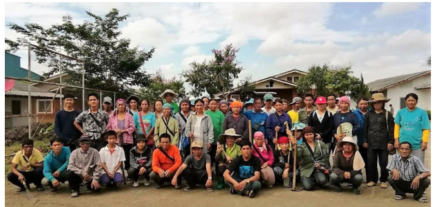
• Parents Giving a Helping Hand at VBAC

TSchool garden activities in a number of our schools have continued this year. The idea behind this program is to teach children how to cultivate and produce food that can be consumed in the school canteens. This program has several objectives: introduction of students to agriculture and the related skills that the students can potentially further develop in the future to generate a source of income; provide agricultural know-how to students to empower the community; raise awareness in villages and rural areas on the importance of environmental protection and the use of sustainable and organic agricultural practices that respect the soil and the natural habitat.