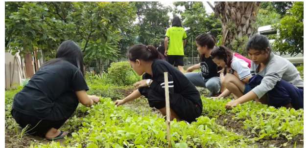
• Students Working in the School Garden Project