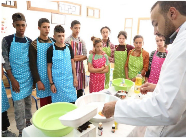
• Introducing Kids to Pastry Class

The school curriculum is designed for students aged from 9 to 17 years old. Students can attend vocational training classes together with regular school classes. During the school week, kids can spend free time in extra-curricular activities such as sports to help them lead their lives as normal children having fun and socialising with friends. The initiative has proved to generate a very positive impact on our beneficiaries and these results were acknowledged by the Moroccan Minister of Education himself in past years. In 2013, to provide a dedicated space and facilities for the project which previously was based at the premises of our partner's site, Centre d'Azrou, the Foundation built a school site for the NEF program, which comprised fully equipped classrooms, workshops, sanitation facilities, kitchen, and canteen.