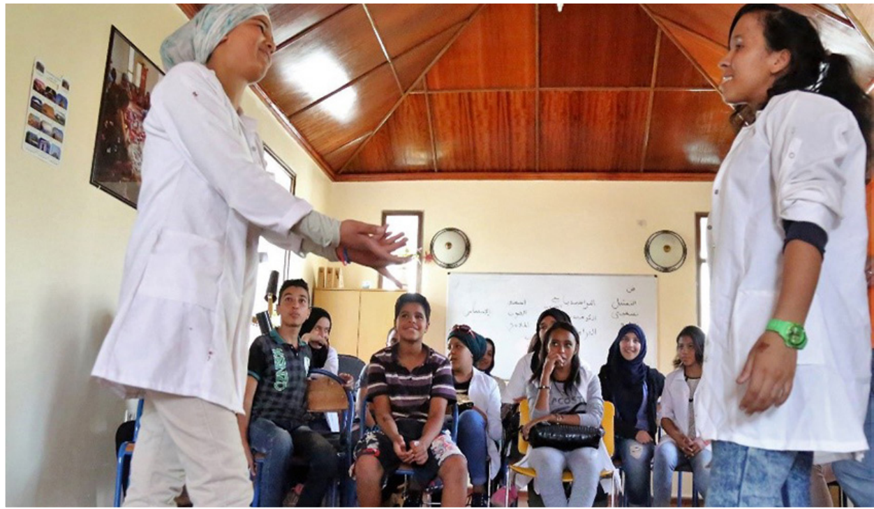
• Theatre Class