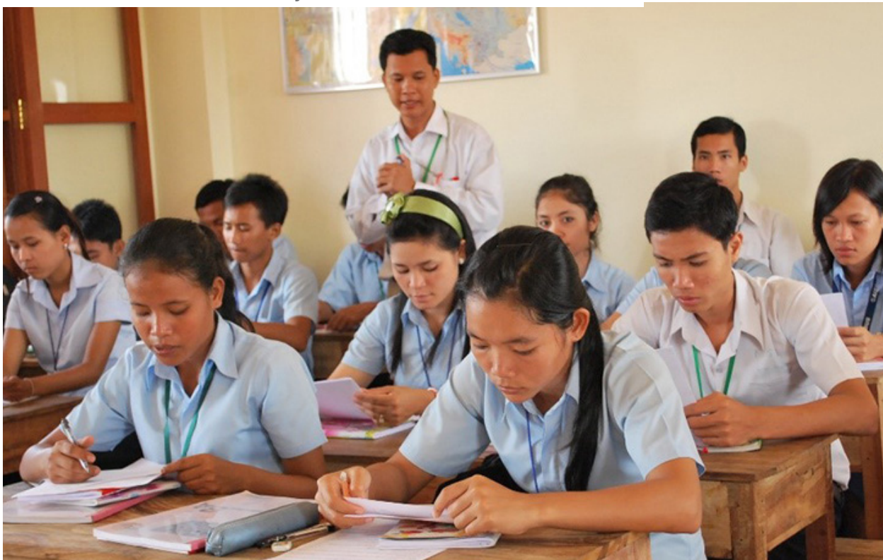
Management Class

In 2006 the Pistorio Foundation, following its key mission to give each child a better future, partnered with Pour Un Sourire d'Enfant (PSE) to support a scholarship program with the key scope of giving children in need who had dropped out of school the possibility of re-enrolling in the education system by offering an accelerated program that covered two academic years in one.