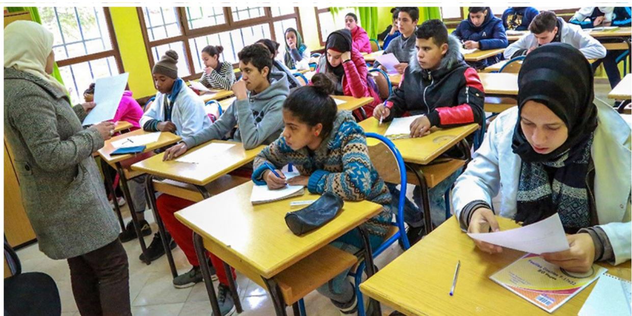
• Students Ready To Start Their Evaluation Exam

The Non Formal Education Program offered by our project provided an alternative to children in need who had dropped out of school and came from critical contexts and backgrounds subjected to social discrimination, criminality, and exploitation. Our school environment and program represented a safe and dependable haven for our beneficiaries as they changed their destinies and blossomed. For the first time, many found a newborn hope of being able to develop and use their talents to create a better future for themselves and their families.