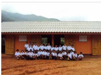
Library and Computer Room Building