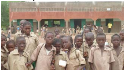
Nibagdo Primary School

Infrastructure Projects Completed: Nibagdo Primary School enlargement; Sogpelce' Secondary School