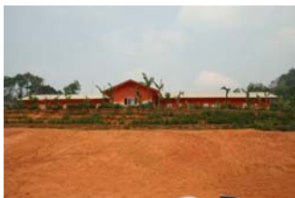
Primary School built in 2009

Huay Kuk is a Hmong hill-tribe village with a population of 427 people and 76 households. The village is on the Laos border, and the school built in 2009 now holds 145 students. 29 students from two neighbouring villages a few kilometres away from Huay Kuk are housed at the school campus dormitory newly built by the Foundation during the school week and they return to their homes on weekends.