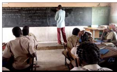
Sogpelce' Secondary School