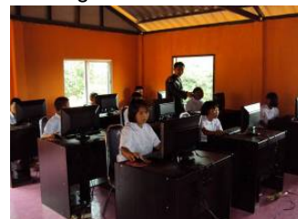
10 PC Computer Room