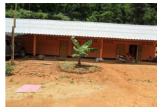
Teacher's accommodations building