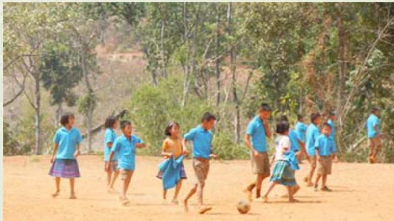
Huay Kuk school students playing soccer outdoors