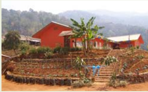
New Six Classroom Primary School of Huay Kuk

The six classroom school, comprising additionally of a teacher's room and sanitation facilities, was opened in the Hmong hill-tribe village of Huay Kuk in May 2009.