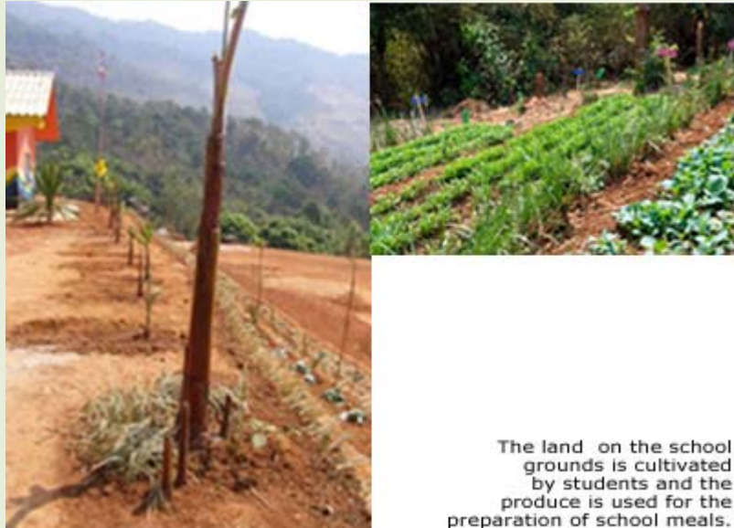
The land on the school grounds is cultivated by students and the produce is used for the preparation of school meals.

During the inauguration, 30 banana trees were planted by participants and participants witnessed that the land in the vicinity of the school grounds has been cultivated by students in order to provide the grains and vegetables for their meals in school. The students are taught cultivation and crop growing skills by the teachers and their success has led to them being self-sufficient in providing for the school meals.