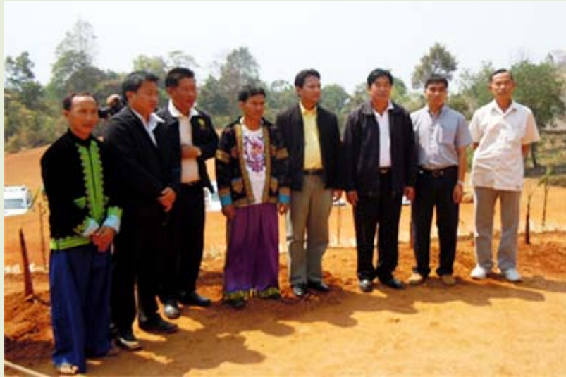
School Administration Staff and Teachers and Village Head

During the inauguration, 30 banana trees were planted by participants and participants witnessed that the land in the vicinity of the school grounds has been cultivated by students in order to provide the grains and vegetables for their meals in school. The students are taught cultivation and crop growing skills by the teachers and their success has led to them being self-sufficient in providing for the school meals.