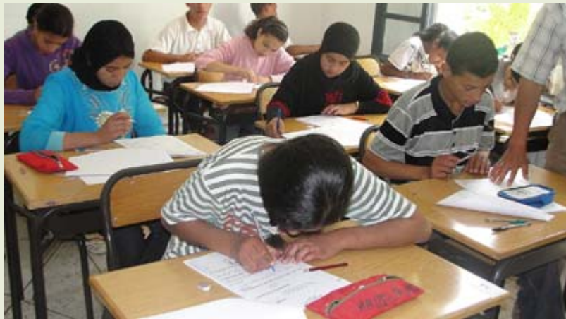
Children in classroom

Children will be reinserted in school within one or two years of having attended the program. Should they not succeed, they will follow a one to two year professional training course so that they may be employed subsequently. The classes will temporarily take place in CADC structures, whilst the construction of the project's building, complete of four classrooms, gym, library, workshop, canteen and kitchen, is taking place. All the children will receive one meal per day and medical check ups throughout the year. The construction is expected to be completed by September 2011. The Pistorio Foundation will be funding part of the construction, together with local Partners and Institutions. The Foundation will support the full scholarships of the students.